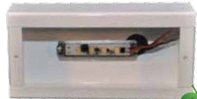
2w WATERPROOF LED STRIP