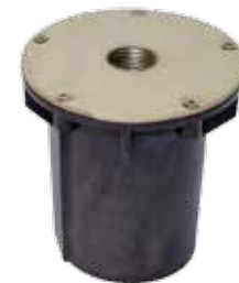
Shown with 1/2" NPS tap on cover