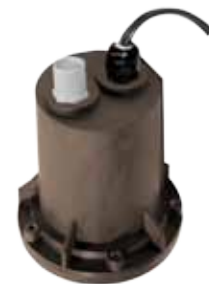
(2) 1/2"NPS threaded ports available on bottom