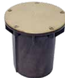
DB-12-75E-BRS DB-12-150E-BRS DB-12-LED10-BRS DB-12-LED60-BRS DBR-55-JB-BRS