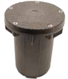
DB-12-75E DB-12-150E DB-12-LED10 DB-12-LED60 DBR-55-JB