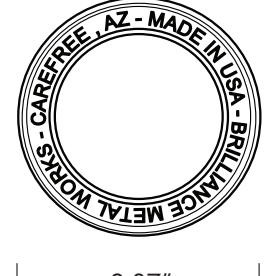
Blackened Brass (BR-BLK)