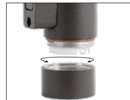
Continuously Adjustable Beam Angles Indexed at 35°, 45°, 55°