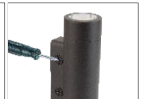
Select Warm White, Pure White, or Cool White (2700K, 3000K or 4000K)

wacighting.com Phone (800) 526.2588 Fax (800) 526.2585