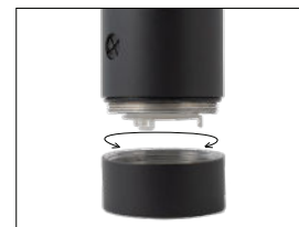
Continuously Adjustable Beam Angles Indexed at 35°, 45°, 55°