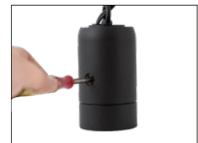
Continuously adjustable brightness