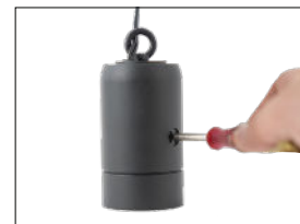
Select Warm White, Pure White, or Cool White (2700K, 3000K or 4000K)